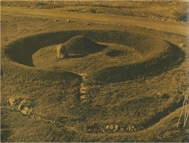
Figure 1. Herbert Bayer, “Earth Mound”, 1954

The first example of artists’ search for form in nature is the “Earth Mound” made by Austrian artist Herbert Bayer in 1954. Located at the Aspen Institute’s Aspen Meadows campus in Colorado, the study consists of a hill, a shallow pit, and a circle surrounding a white rock. The opening in the circle allows visitors to enter the work.