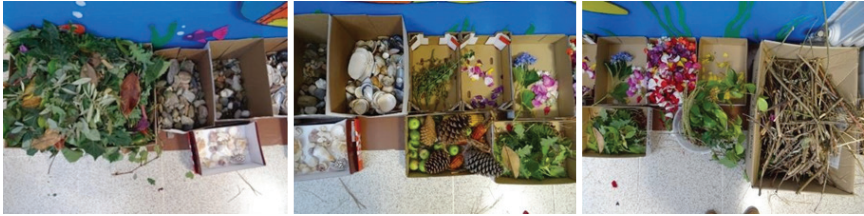
Figure 13.14. 15. Stage 2: Classification of material collected from nature