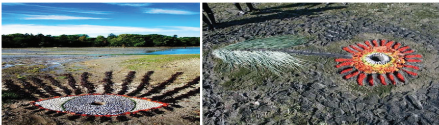
Figure 23.24. Land Art works by students around Queen Maud University College

In 2012, Queen Maud University College students examined Goldsworthy's landart works and realized the land art works seen in the pictures below, based on the works of the artist they were inspired by. The study emphasizes that the process of installation, dialogue, discussion and creative thinking are as important as the product, apart from teaching mathematics. Similarly, these studies are considered important in terms of developing the perception of location in the early childhood education.