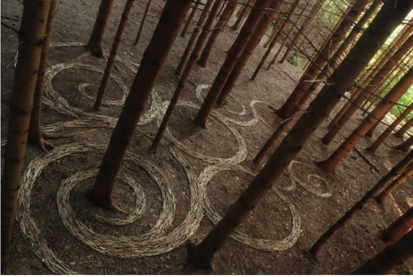
Figure 5. Sylvain Meyer, Sapien , İsviçre

( https://inhabitat.com/sylvain-meyer-transforms-elements-of-nature-into-beautiful-environmental-art/sylvain-meyer3/ )