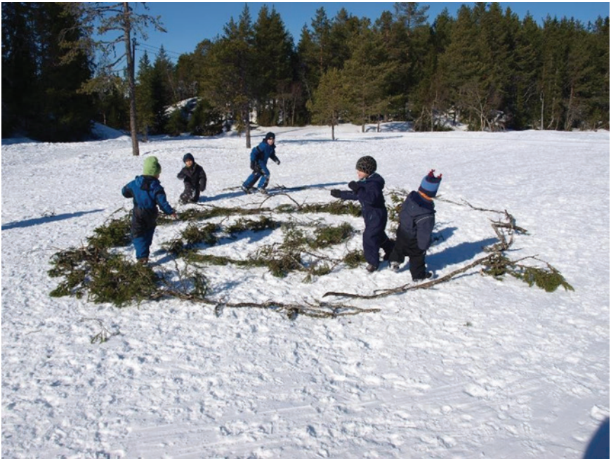
Figure 12. ( http://www.ijea.org/v17n21/index.html )

Solberg (2016), “Land art in preschools. In his research titled “An art practice”, he stated that his aim in making site-specific art projects with preschool children and teachers is to raise awareness of children towards their environment and to make art with the possibilities of our natural environment. While doing this, he emphasizes that it is essential to activate their minds, senses and intuitions. A camp lasting several weeks was organized with children aged between three and six years in an open-air kindergarten established in a forest area close to Trondheim, Norway. After the environmental tour, the children were asked to collect the materials found in nature, and both an artistic work and a playground were created with these materials.