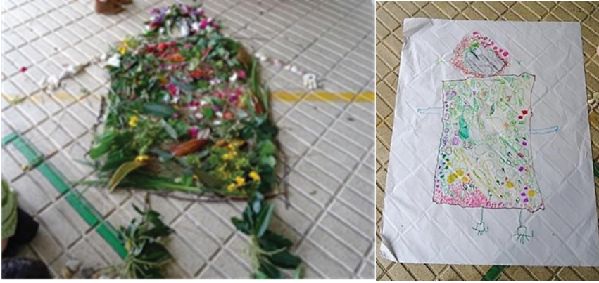
Figure 21. 22. Phases 5 and 6: creating the design and drawing the design on paper

( https://uvadoc.uva.es/bitstream/handle/10324/52983/revistas_uva_es_edmain_article_view_5886_4406.pdf?sequence=3&isAllowed=y )