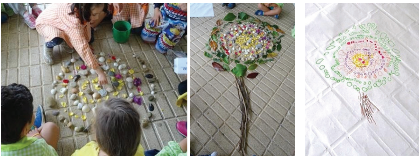
Figure 18. 19. 20. 5. and 6. Stages: creating the design and drawing the design on paper

( https://uvadoc.uva.es/bitstream/handle/10324/52983/revistas_uva_es__edmain_article_view_5886_4406.pdf?sequence=3&isAllowed=y )