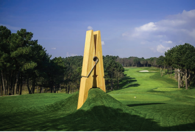
Figure 9. Mehmet Ali Uysal, Deri (Skin) heykeli

( https://www.piartworks.com/artists/36-mehmet-ali-uysal/works/9403-mehmet-ali-uysal-skin-2-2010/ )