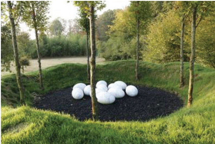
Figure 6. Nils-Udo, Volcan , Porquerolles Adası Fransa, 2018

Swedish artist Sylvain Meyer created an interactive contrast between the two colors by creating swirls with light-colored twigs on the dark dry leaves that fell to the ground in the area where the tree group is located in a forest in Sweden.