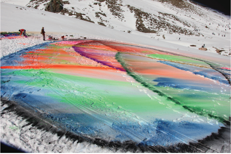
Figure 8. Yücel Dönmez, Antalya Saklıkent kayak merkezi, 2013

( https://turkishartmarket.wordpress.com/2014/06/29/bir-sanat-ustasi-ve-sanatin-eksik-oykusu/ )