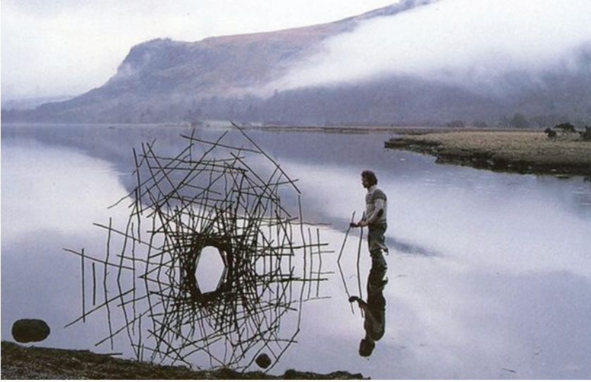
Figure 3. Andy Goldsworthy

The most iconic piece of Land Art is Robert Smithson's Spiral Jetty, which resembles a giant fossil in the Great Salt Lake in Utah. This work, which can still be watched by visitors, is about 6,000 tons of basalt, gravel, salt and sand, etc. collected from the coast. It is in the form of a reverse spiral using the material. Due to the nature of a bacteria and algae species, the periodic transformation of the salt lake water into red and pink color increases the effect of the artifact.