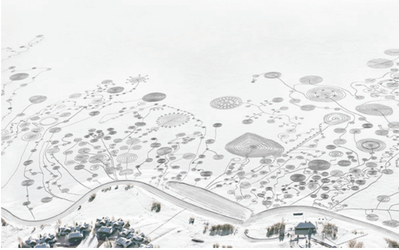
Figure 7. Sonja Hinrichsen

Nils-Udo creates new and original designs in very different geographies such as Connemara, Reunion Island, Vassivière Island and Central Park, inspired by the materials he collects in the natural environment specific to that geography. “Drawing with flowers. Painting with clouds. Writing with water. Following the May wind, the path of a fallen leaf. Working for the storm. A glacier awaits. Guiding water and light... Counting a forest and a meadow...” Nils-Udo ( https://domaine-chaumont.fr/en/centre-arts-and-nature/archives/2018-art-season/nils-udo ) With his words, Nils-Udo expresses what an active role nature plays in artistic creation.