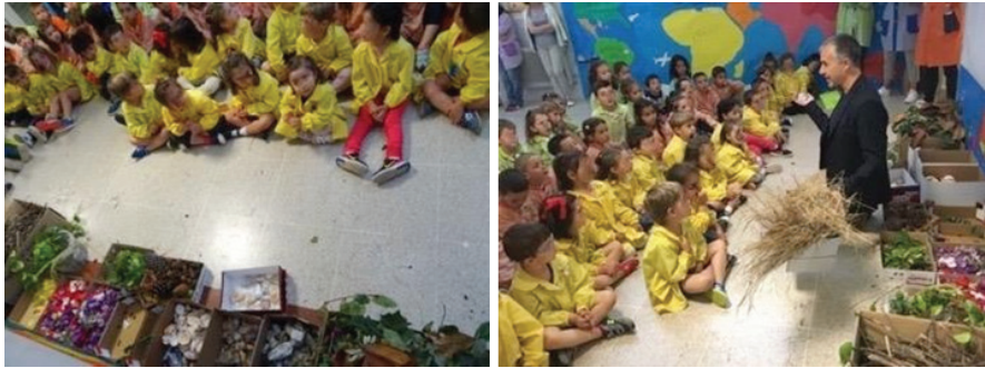
Figure 16. 17. Stages 3 and 4: Asking questions about materials – discussion