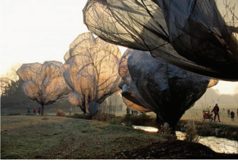
Figure 4. Christo and Jeanne-Claude, Wrapped Trees, Fondation Beyeler and Berower Park, Riehen, Switzerland, 1997-98. ( https://artreview.com/christo-1935-2020/ )

178 trees, whose height is between two meters and 25 meters and whose diameters vary from one meter to 14.5 meters, were wrapped with 55,000 square meters of woven polyester fabric and 23 kilometers of rope. “The branches of the Wrapped Trees pushing the translucent fabric outward created dynamic volumes of light and shadow, moving in the wind with new forms and surfaces shaped by the ropes on the fabric” ( https://christojeanneclaude.net/artworks/wrapped-trees/ )