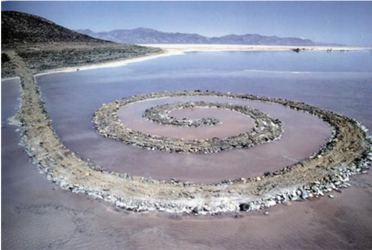
Figure 2. Robert Smithson, Spiral Jetty , Rozel Point, Great Salt Lake, Utah, ABD, 1969-70